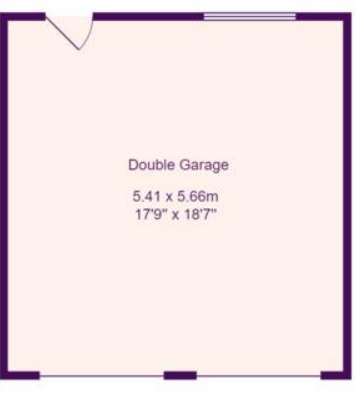
Area: 30.7 m<sup>2</sup> ... 330 ft<sup>2</sup>

All measurements are approximate and for display purposes only