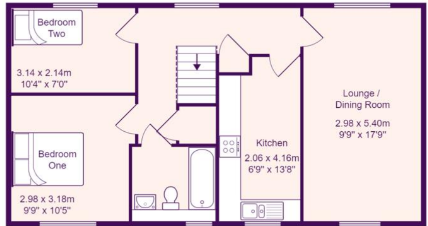
First Floor Area: 56.1 m 2 ... 604 ft 2